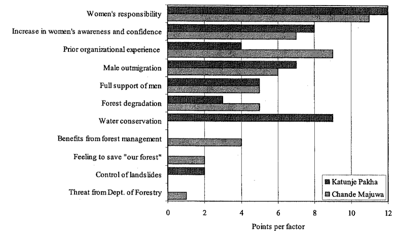
Figure 1: Weighed ranking of factors that motivated women to increase their participation in the management of the community forest. [Note: Each of the 10 women participating in the focus groups was given 5 points to distribute among the factors listed. Not all factors were listed in both CFUGs.]

Since in Nepal the collection of forest products such as fuelwood, fodder, grass and bedding material is mainly women's responsibility [4, 9], women in both