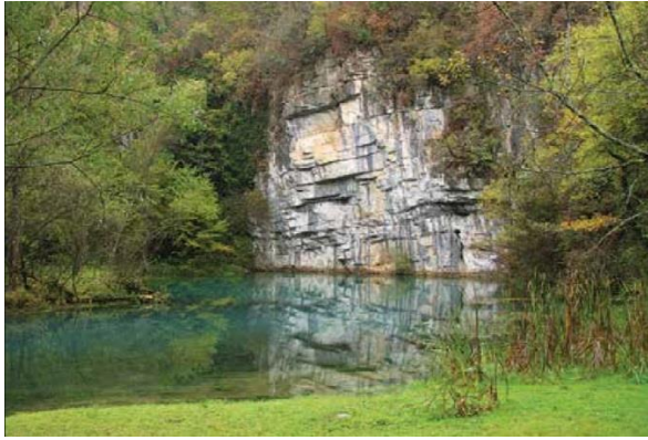
Plut D. et al., 2014. Regionalni viri Slovenije: Vodni viri Bele krajine (Water resources of Bela krajina), 15.