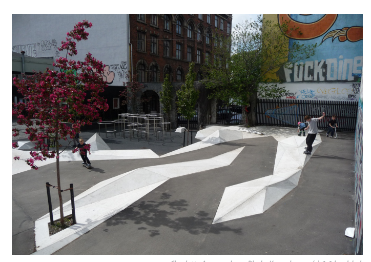
Charlotte Ammundsens Plads, Kopenhagen