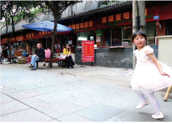
Chongaina Route, China