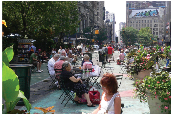
rald Sauare. New York