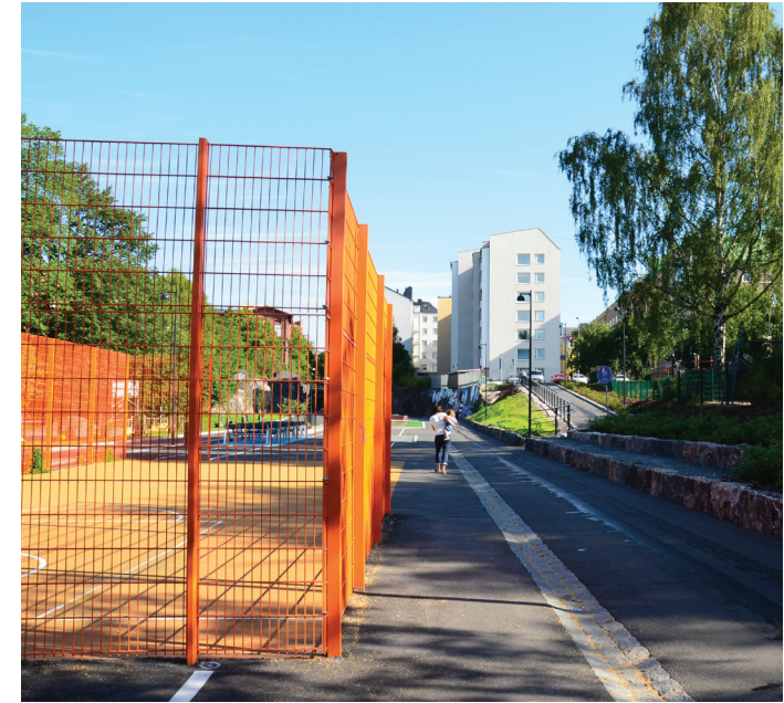
Banaa, Helsinki