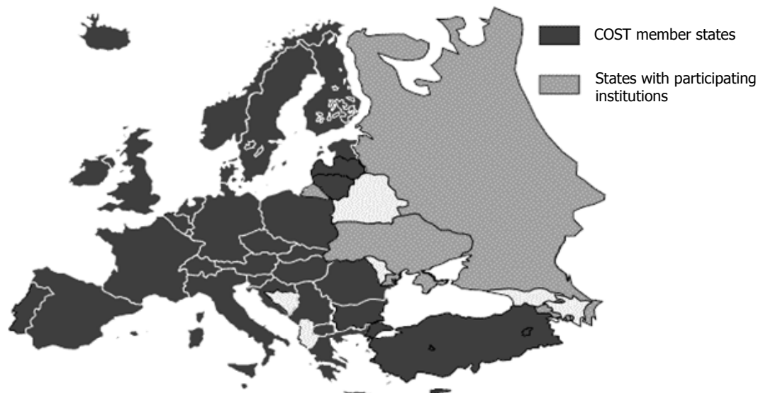
34 member states in COST

The member countries participate on an "à la carte" principle and activities are launched on a "bottom-up" approach. One of its main features is its built-in flexibility. This concept clearly meets a growing demand and in addition, it complements the Community programmes. COST has a geographical scope beyond the EU and most of the Central and Eastern European countries are members. COST also welcomes the participation of interested institutions from non-COST member states without any geographical restriction. COST has developed into one of the largest frameworks for research co-operation in Europe and is a valuable mechanism co-ordinating national research activities in Europe. Today it has almost 200 Actions and involves nearly 30,000 scientists from 34 European member countries and more than 80 participating institutions from 11 non-member countries and Non Governmental Organisations.