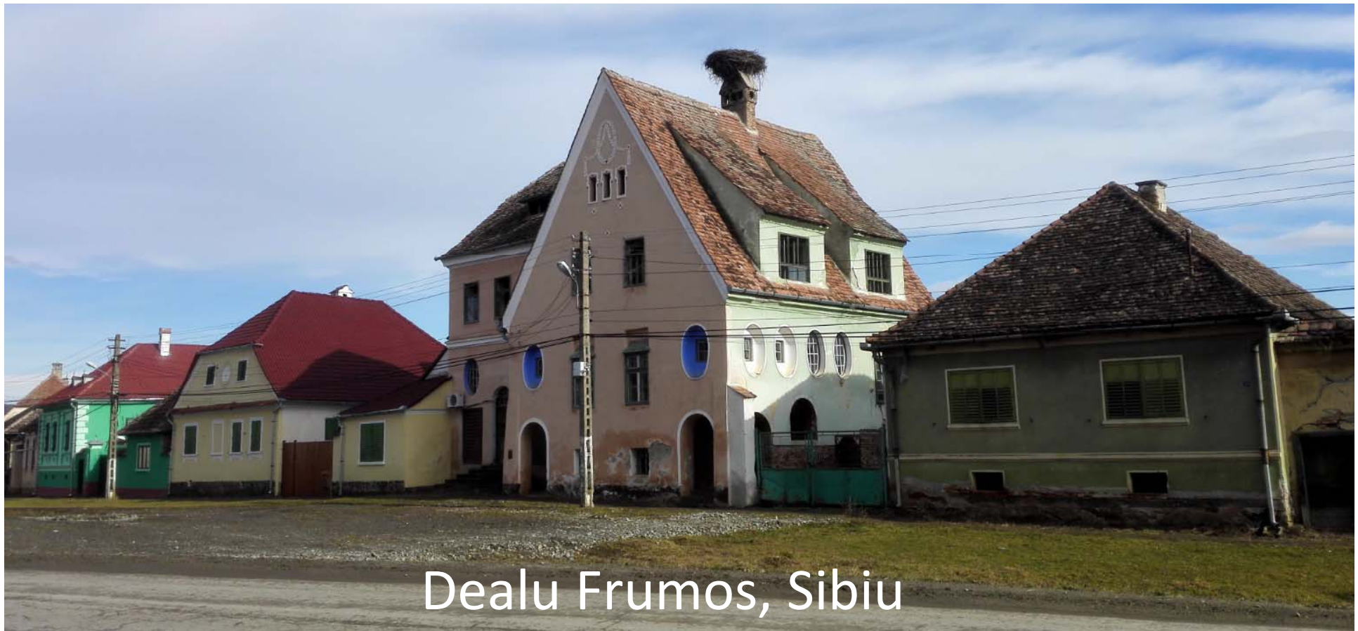
Dealu Frumos, Sibiu