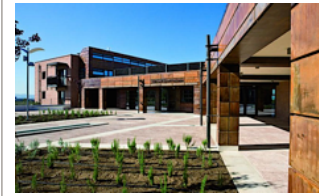
PERROTIS COLLEGE CAMPUS OF AMERICAN FARM SCHOOL

Master on Bioeconomy and Circular Economy-BIOCIRCLE Italy www.masterbiocirce.com