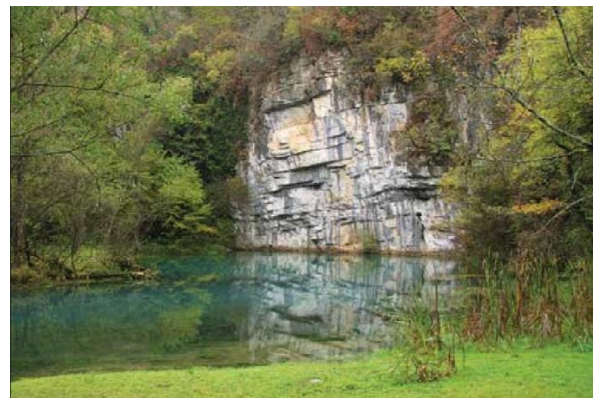
Plut D. et al., 2014. Regionalni viri Slovenije: Vodni viri Bele krajine (Water resources of Bela krajina), 15.