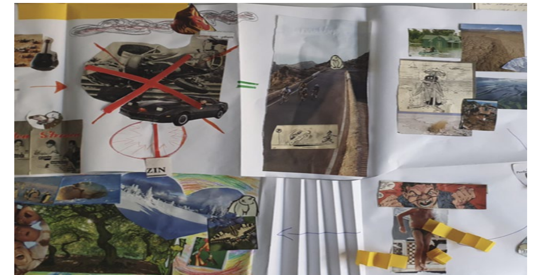
Salzburg © Plank