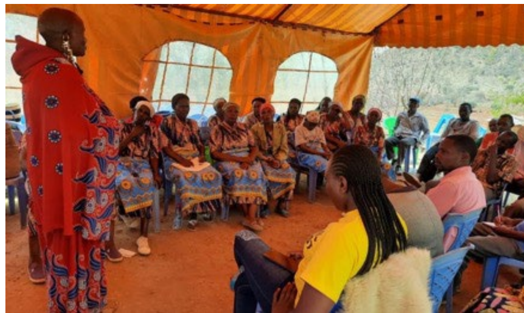
Kenya @ Lemke