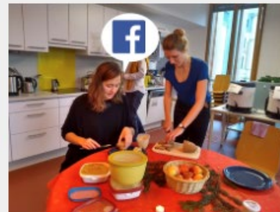
IDR on Facebook