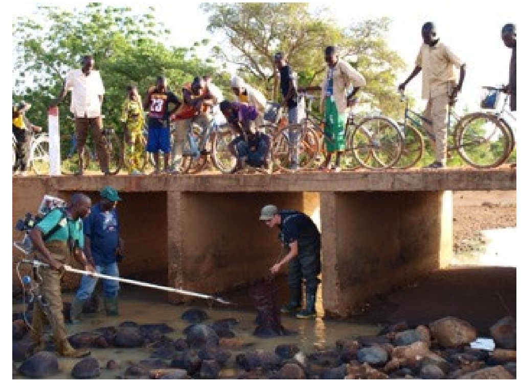
Burkina Faso