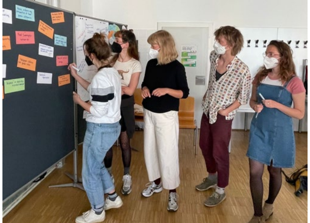
Gender, Nutrition, Right to Food @ Lemke