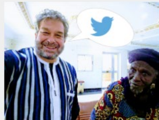
IDR on Bluesky

We see development as change. Our inter- and transdisciplinary work focuses on the structural drivers of inequality, conflict, and ecological crises and processes of change at the local, regional, national, and international level. We lay the groundwork for evidence-based strategies aimed at a good life for all.