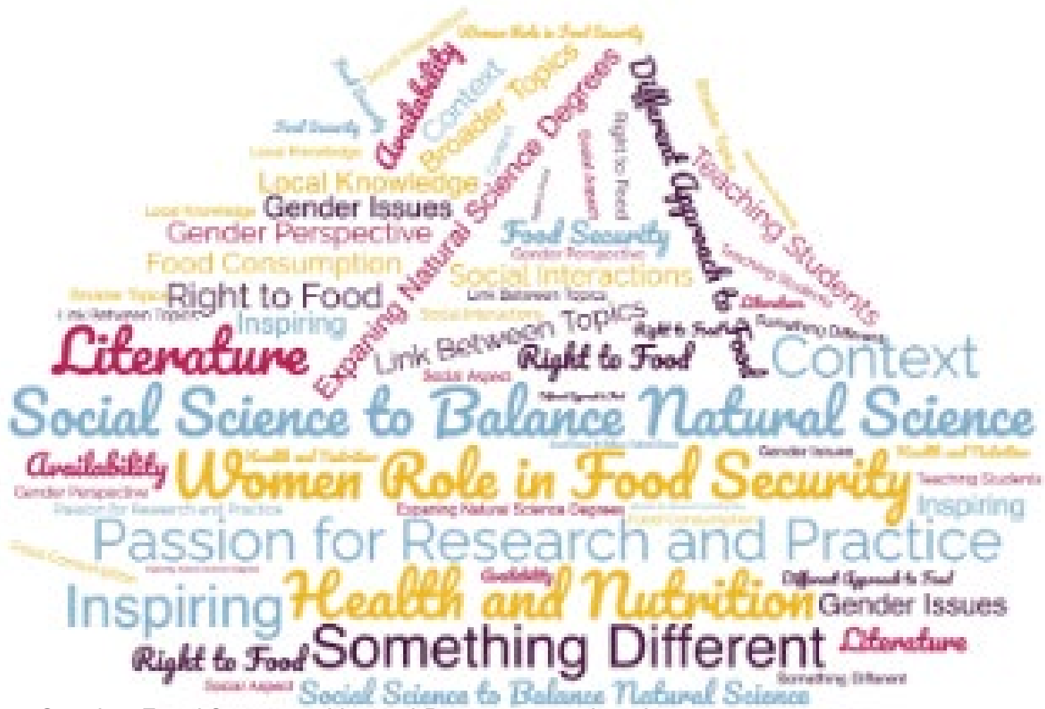
Gender, Food Systems, Natural Resources @ Lemke