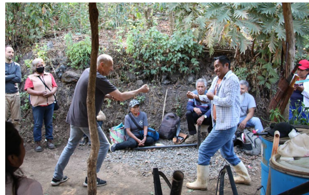
© Pohlmann, Teikei coffee, Oaxaca (n.d.)