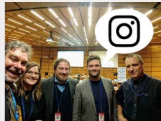
IDR on Instagram