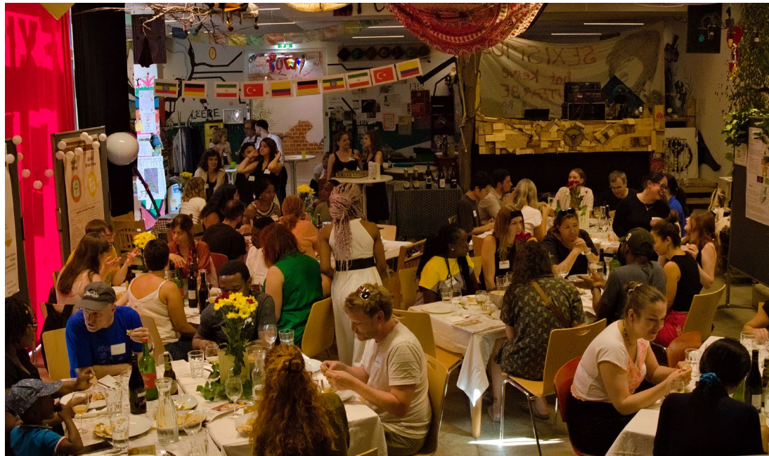
Scientific Communication and Impacts @ Melcher