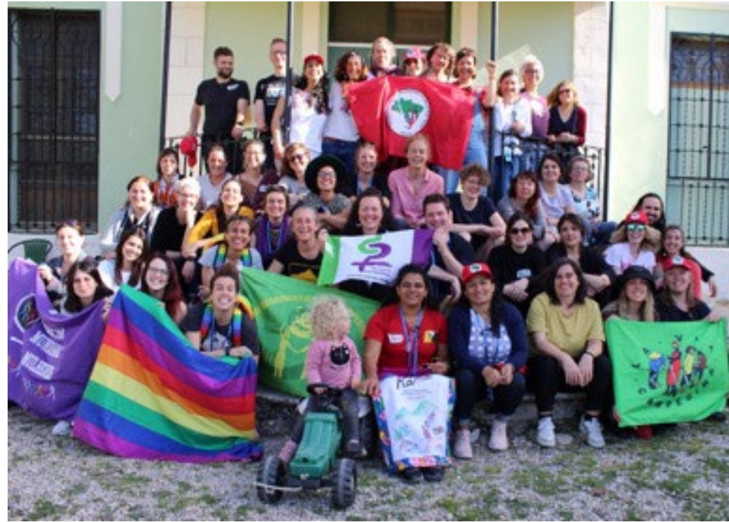
Spain @ Calvet