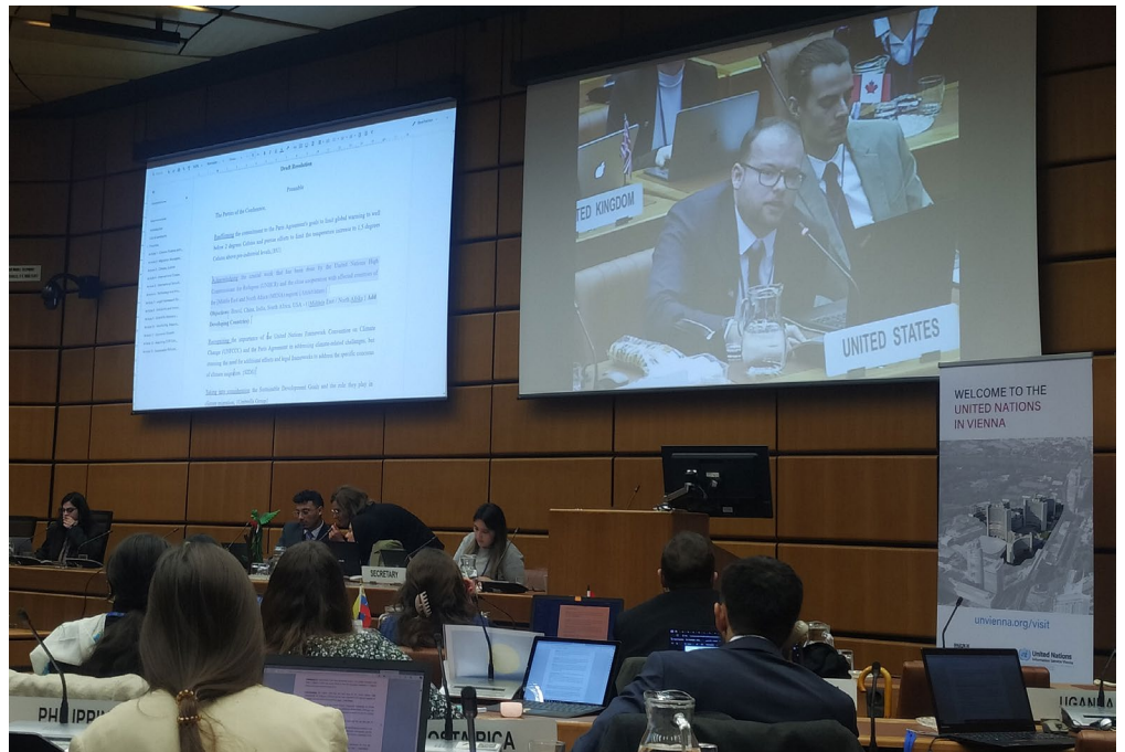
Negotiating Change, United Nations Vienna @ Probst