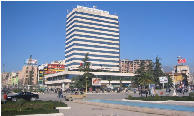
Tirana International Hotel

Please check the EAGE website ( www.eage.org ) for the most up to-date information