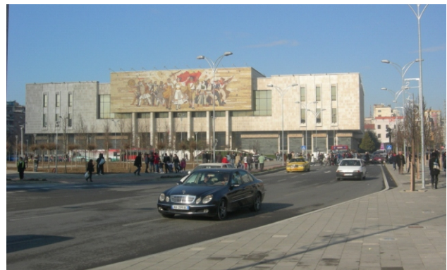
National History Museum

The oldest archaeological remains in downtown Tirana are a Roman