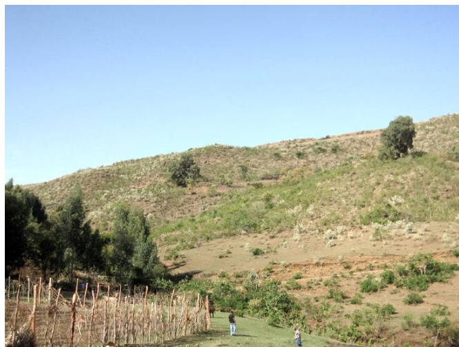
Pic. 1: View towards the previously established enclosure of the project carried out by Dr. Abrham and Prof. Georg Gratzler.

Ambober is connected to the main highway with a 10 km dry weather road. The main highway connects the regional capitals Bahir Dar and Gondar. The average land holding is 0.56 ha. The farming system is mixed crop livestock system where trees also form valuable components. The area is a transition zone between low production potential cereal-livestock zone in the east and high production potential cereal-livestock zone in the west and south. A typical household is entitled over three parcels of land. The first parcel of land is located surrounding the homestead. The second and the third parcels located away from the homestead. This is the result of the government land redistribution programme.