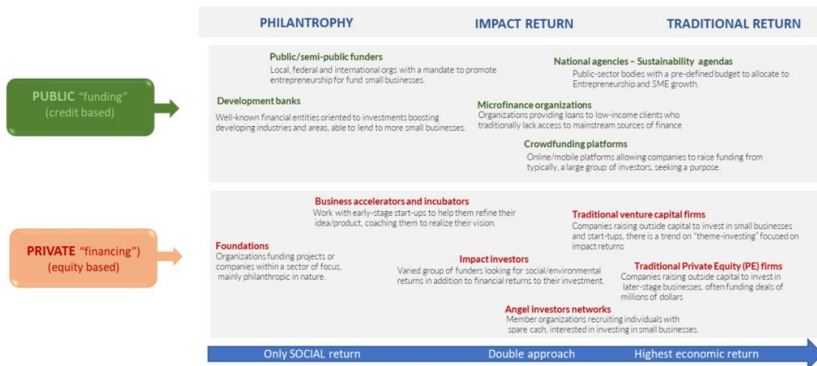
Figure 1 Funding opportunities (Public & Private)

The different sources presented in Annex 3 have been identified as potential funding opportunities for the different BBECs.