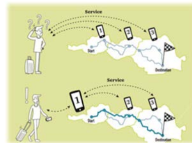
Figure 4: Linking of services through digital journey planner (Austriatech.at, 2019)