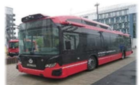
Figure 3: Scania automated full-sized bus which is expected to be deployed in public roads (Susilo)